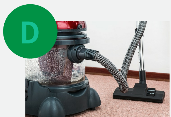
A Rigid shop vac will occupy a 2' square area