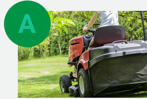
Depending on deck size, the average lawn tractor is 48" x 72"