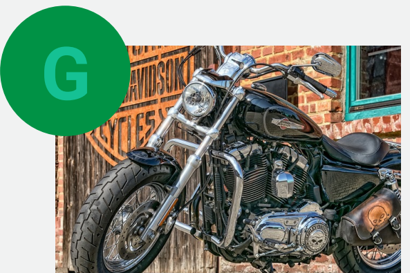
Your Harley Street 750 will need around 7.5' to park and leave you room to pull ride out