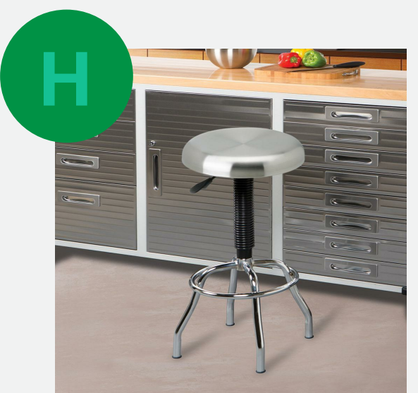
In the larger shed we've left room for a 4' wide by 2' deep work bench. This also allows room for a nice stool and Rigid shop vac to nest under the table top.