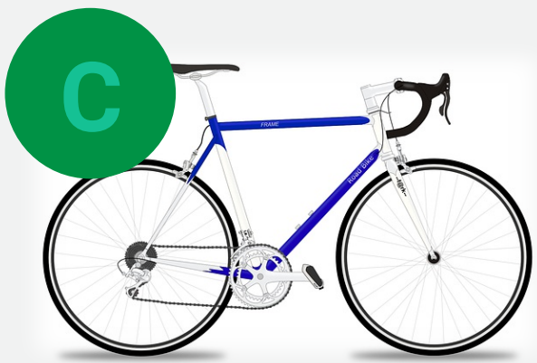
Room for two bikes side by side or these can be hung on a wall