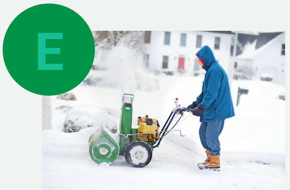
The typical Toro snow blower is 2' wide and up to 4' long with the handles out