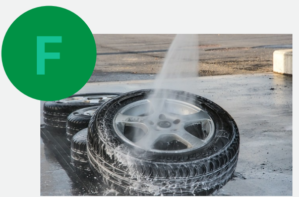
A Honda power washer will use up about 20" x 24" of space