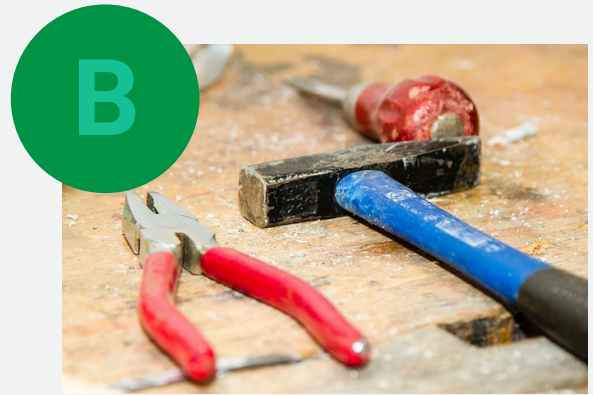
A 15 drawer Husky tool chest is 52" by 20" deep